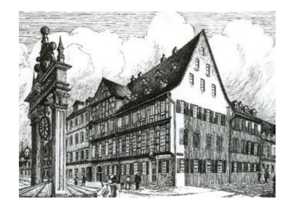
1660 Founding of the Heraeus family business