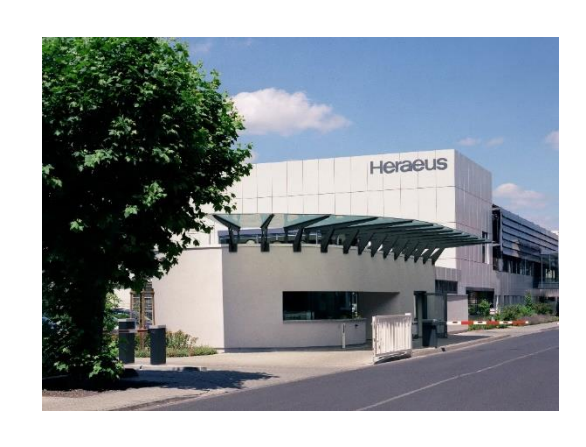
2021 Globally leading portfolio company